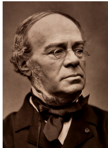
Jacques Fromental Halévy

was a cantor's son who became one of the most successful opera composers in 19 th -century Paris. His grand opera, La Juive ( The Jewess ) premiered in 1835 and achieved tremendous popularity.