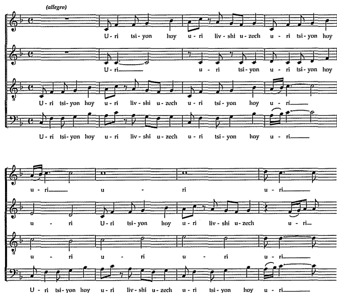
Figure 26. Moshe Wilenski, "Uri Tsiyon" (mm. 25-32)