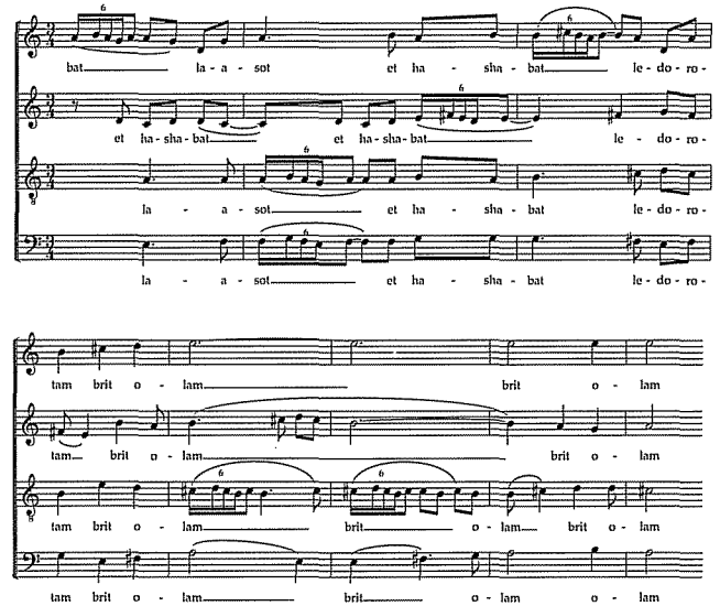
Figure 10. Ben-Haim, "Kabbalat Shabbat" (mm. 8-14)

Braun argues that, in most cases, the tetrachord can be broken down into a minor third, with the addition of a major