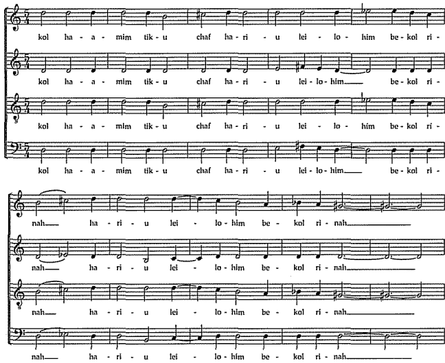
Figure 7. Avni, "Mizmorei Tehillim" (mm. 11-20)