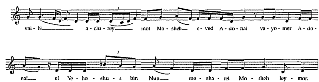
Figure 12. Cantillation of the Prophetic Lesson, Lithuanian Jewish tradition