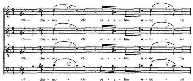
Figure 11. Ben-Haim, "Kabbalat Shabbat" (mm. 3-4)