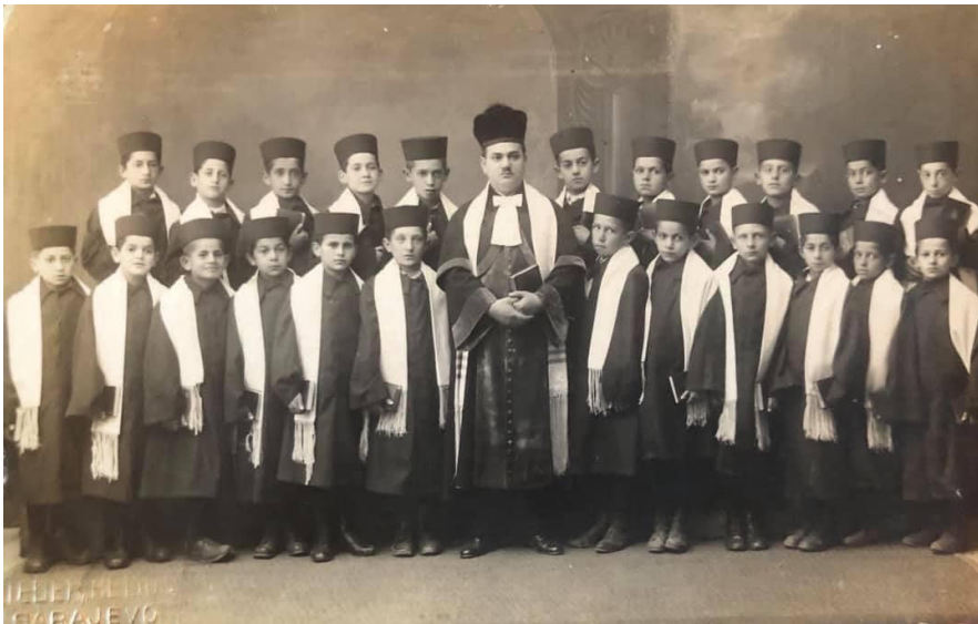
Hazzan and Boys Choir, Sephardic Temple Choir, Sarajevo, early 20th century, Undated.

From the 17th century onward, choral music became the defining feature of the musical identity of Western Sephardic Jews